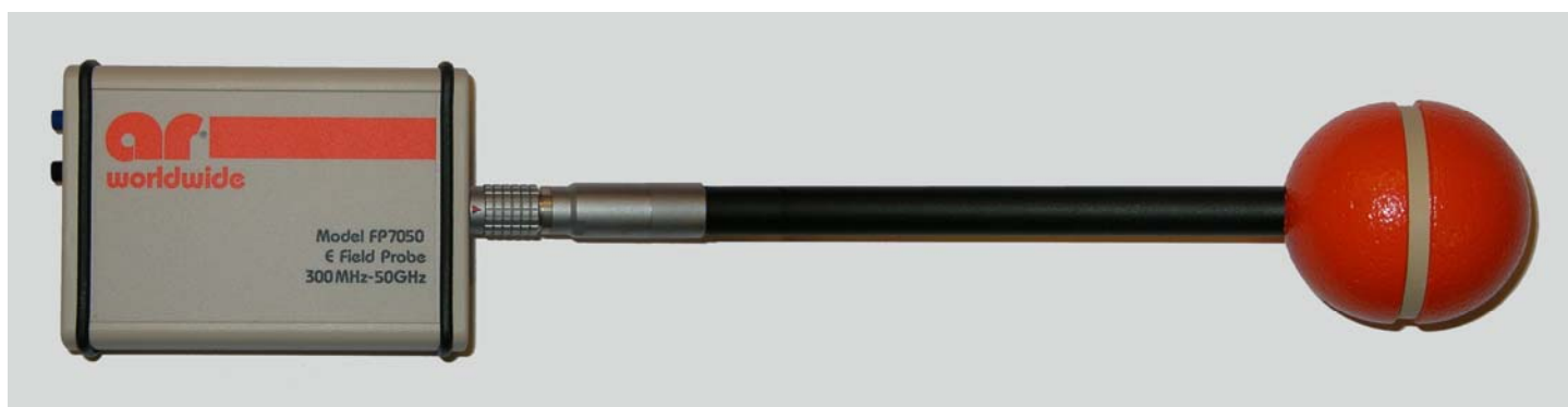
FP7050 Operating Limits

The FP7050 is a broadband isotropic electric field measurement instrument for use in EMC and EMI applications. The FP7050 communicates through glass fiber optic cables (up to 100 meter cable between the FM7004 and the FP7050) to the master control center FM7004. Unlike typical field probes that use diode sensors, the FP7050 employs a thermal sensor designed to measure the high field strength of pulsed (radar) fields. The thermal sensor design gives this probe the ability to read the true Root Mean Squared (RMS) level of a given field. This probe only returns composite values.